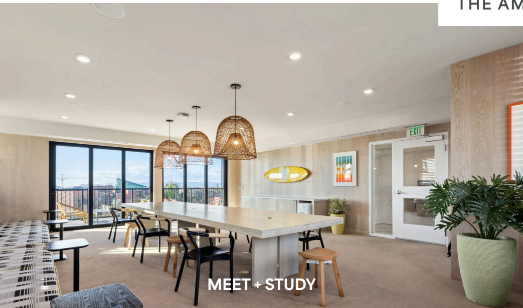
MEET + STUDY