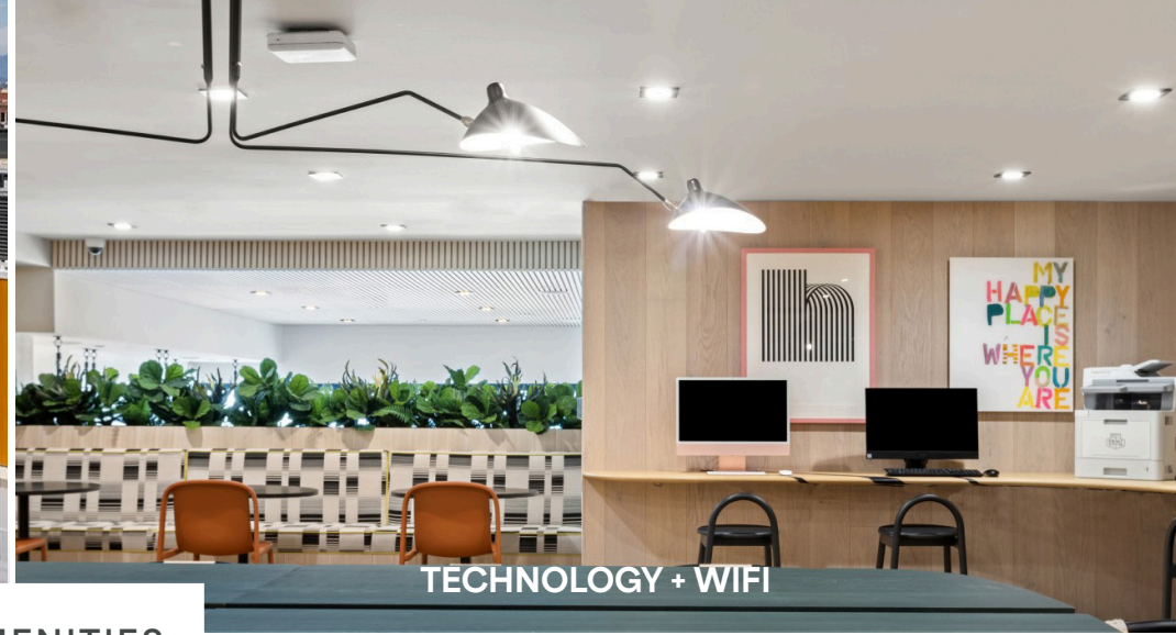
TECHNOLOGY + WIFI