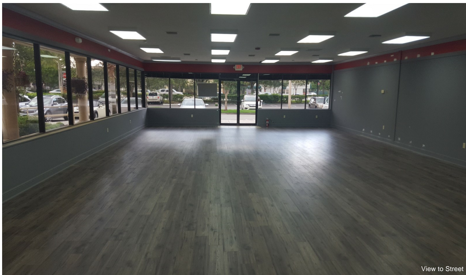
View to Street