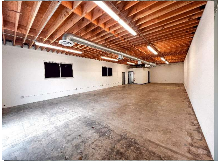
Warehouse Open Space