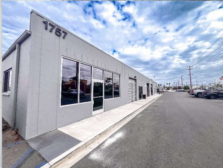
Front of Unit