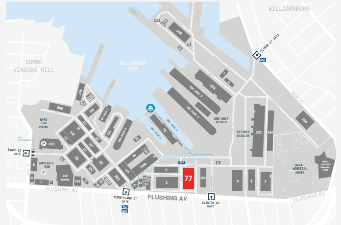
BLDG 77 LOCATION