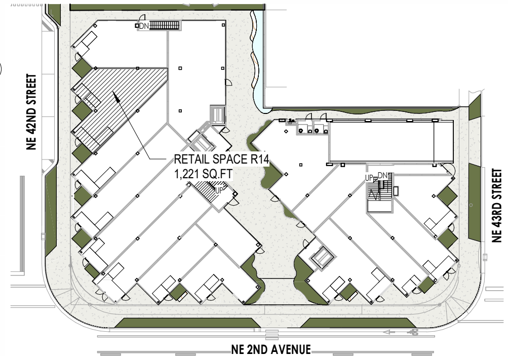
1 KEY PLAN SCALE: 1" = 50'-0"

THE INFORMATION PROVIDED ON THE LOD IS BASED ON INFORMATION FOUND IN THE BASE BUILDING (VENDOR PACKAGE) CORRESPONDENCE OR WORKING DRAWINGS AND MAY NOT REFLECT FINAL "ON-SITE AS IS" CONDITION NOR ALL CONDITIONS THAT MAY RESULT FROM ON SITE ADJUSTMENTS DURING CONSTRUCTION. THE LOD IS NOT INTENDED TO REFLECT EVERY CONDITION WITHIN THE SPACE WITH RESPECT TO STRUCTURE & MEP ONE OFF CONDITIONS. ADDITIONALLY, SCHEMATIC DESIGN DEVELOPMENT DRAWINGS ARE SUBJECT TO CHANGE AS THE PROJECT DOCUMENTS ARE FINALIZED. IT IS THE RESPONSIBILITY OF THE TENANT'S ARCHITECT AND CONTRACTOR TO FIELD VERIFY ALL INFORMATION PERTAINING TO THE PREMISES PRIOR TO COMMENCEMENT OF TENANT DRAWINGS & CONSTRUCTION.