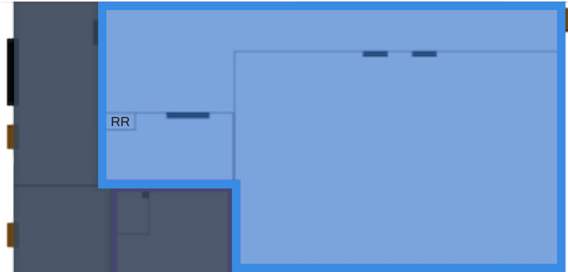
UNIT 103 FLOOR PLAN: ±3,036 SF