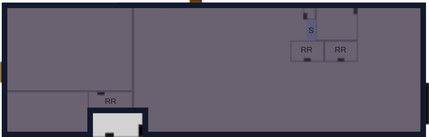
UNIT 115 FLOOR PLAN: ±3,122 SF