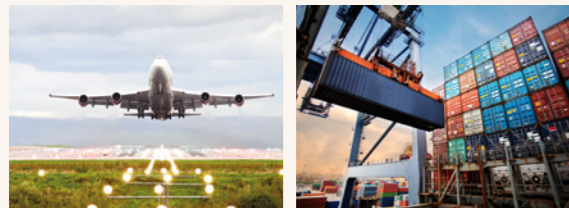
UNIT 5 PACIFIC WAY M50 1DL

Eccles Railway Station is situated less than a mile to the north west of the property. Manchester Airport is located approximately 7.5 miles to the south.