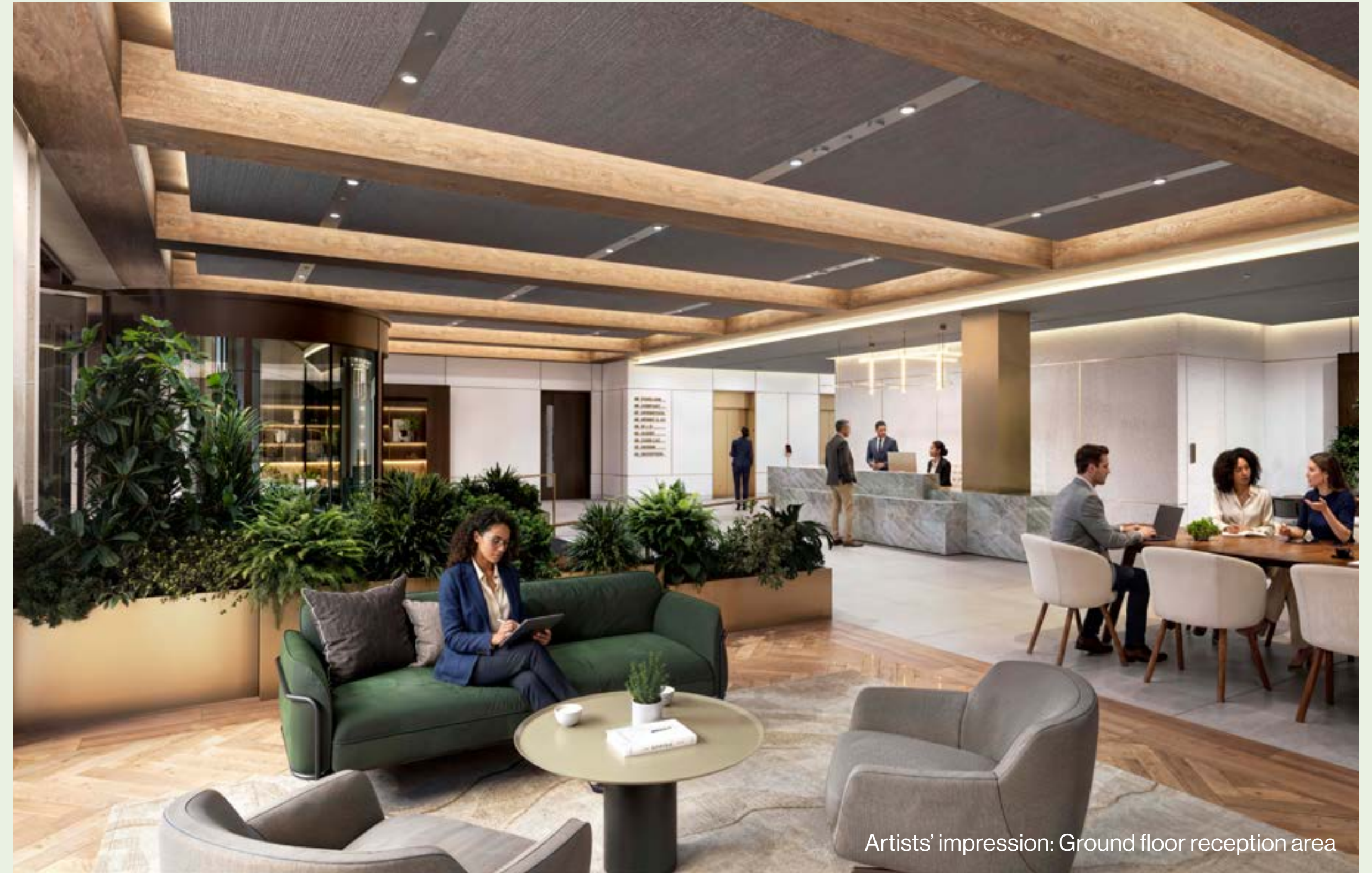
Artists' impression: Ground floor reception area