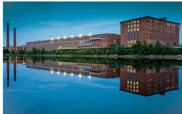
WATERFRONT ELEGANCE Enjoy a stunning setting just steps from your office.