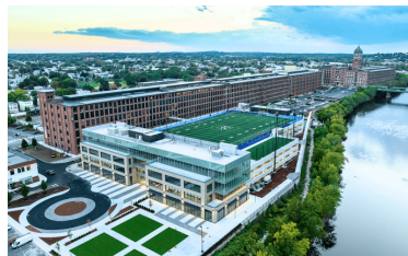
THE PAVILION - WORK & PLAY Enjoy a 1,250-space parking garage and lively events at The Field.