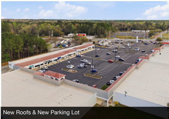
New Roofs & New Parking Lot