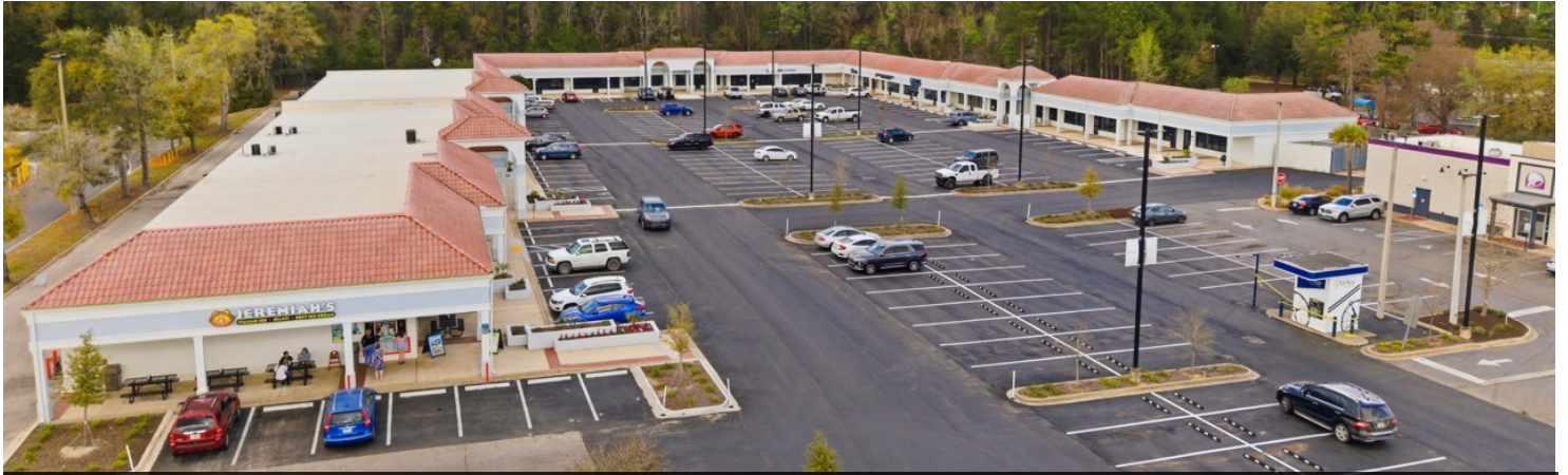
New Tenants Jeremiah's Italian Ice & Fyzical Therapy