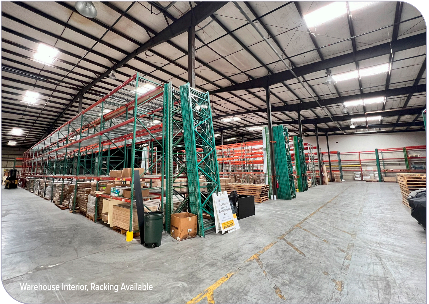
Warehouse Interior, Racking Available

±33,000 SF DOCK HIGH WAREHOUSE | TERM THROUGH AUG 2026