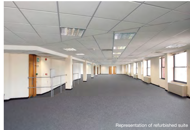
Representation of refurbished suite