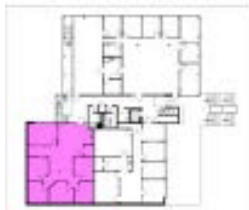
First Floor Inset