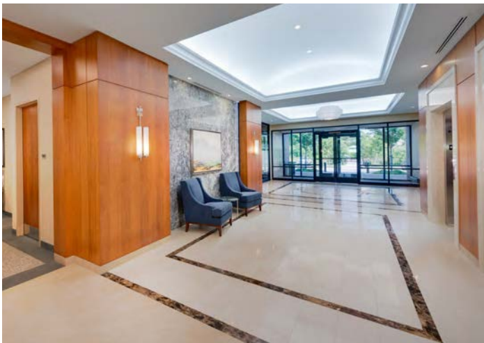
Below, From Top to Bottom: Interior lobby of 181 Harry S. Truman Parkway; Courtyard amenity at Annapolis Corporate Park

Annapolis Corporate Park is just five miles from downtown Annapolis, with quick connections to Baltimore, Columbia, and DC markets, as well as BWI Airport.