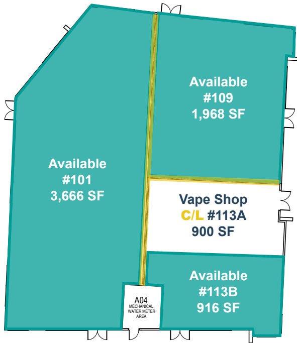
Building A | 8,000 SF 63 Copperpond Passage SE