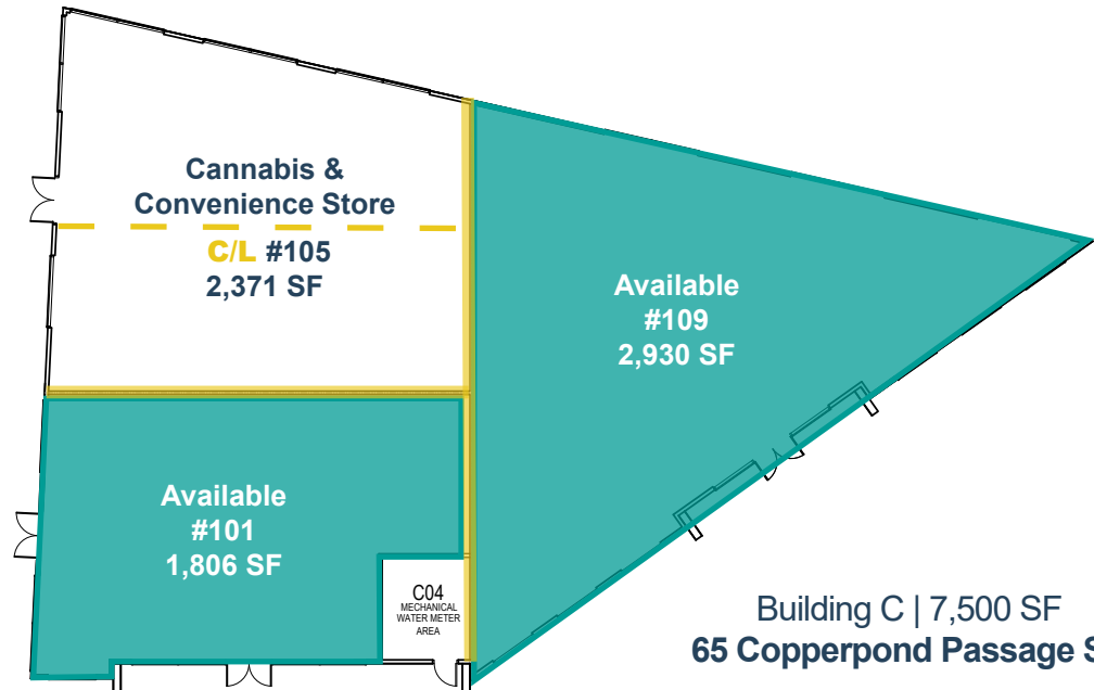
Building C | 7,500 SF 65 Copperpond Passage SE