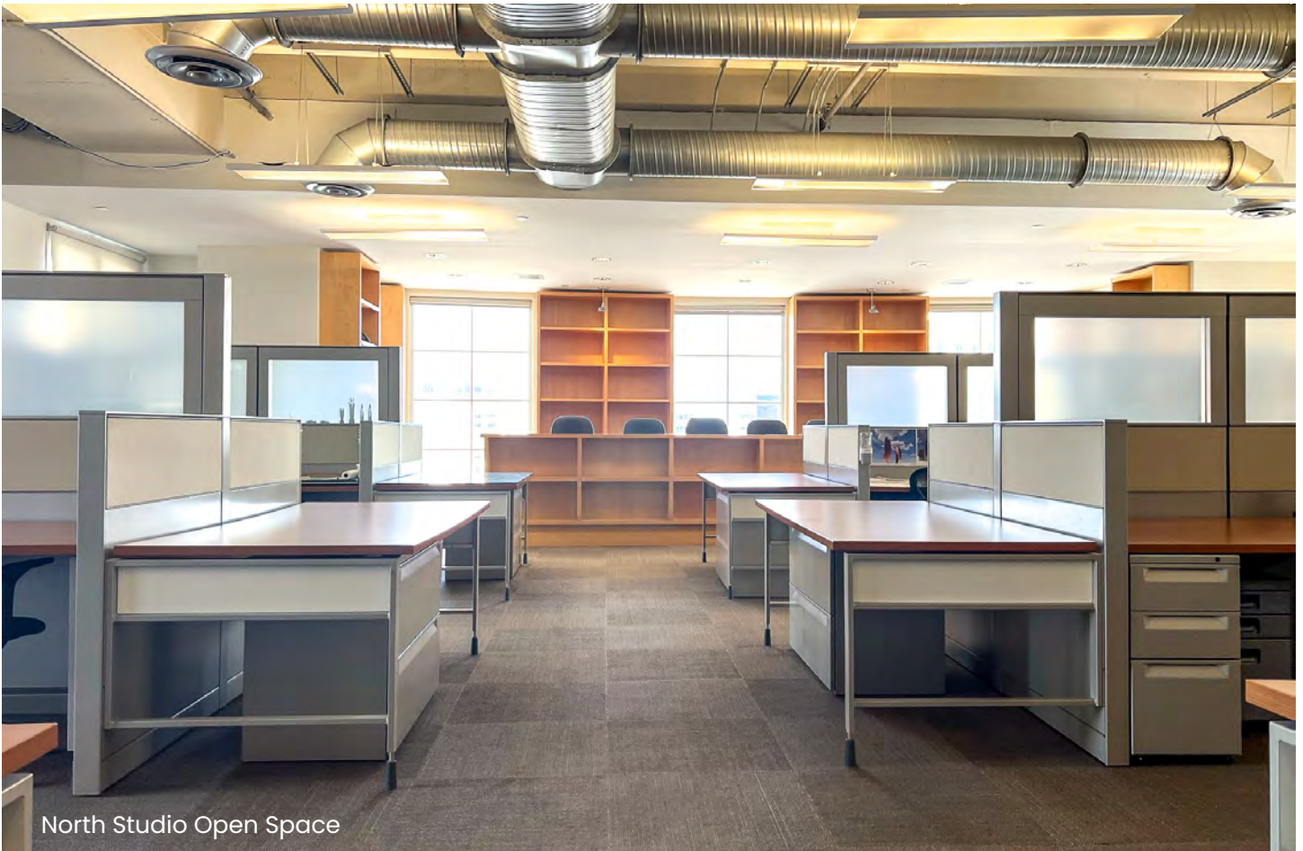
North Studio Open Space