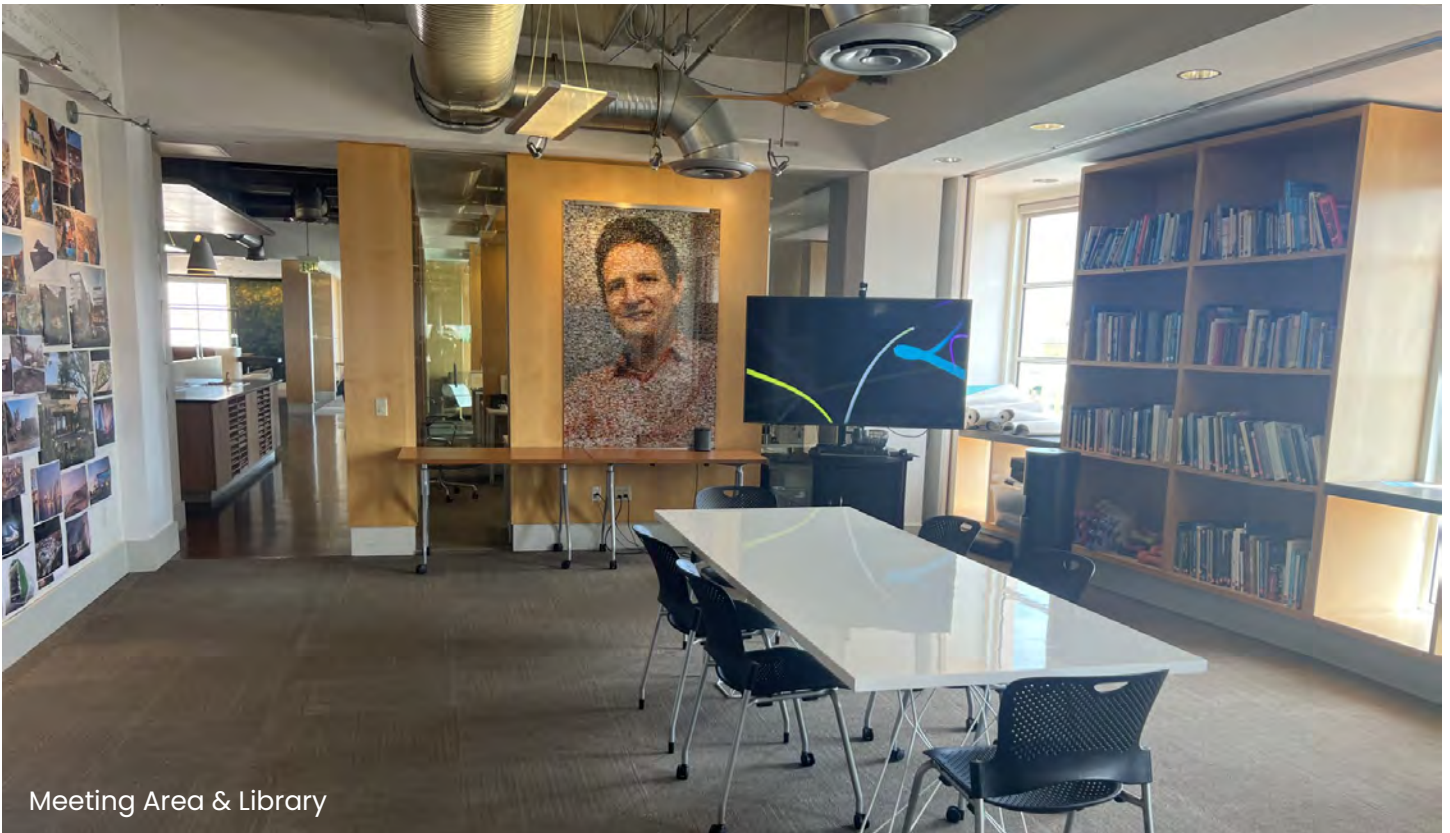
Meeting Area & Library