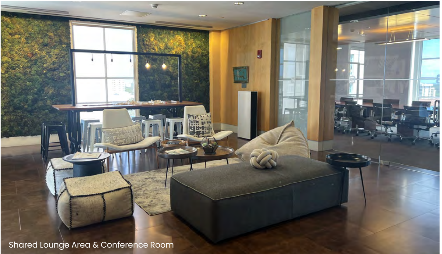
Shared Lounge Area & Conference Room