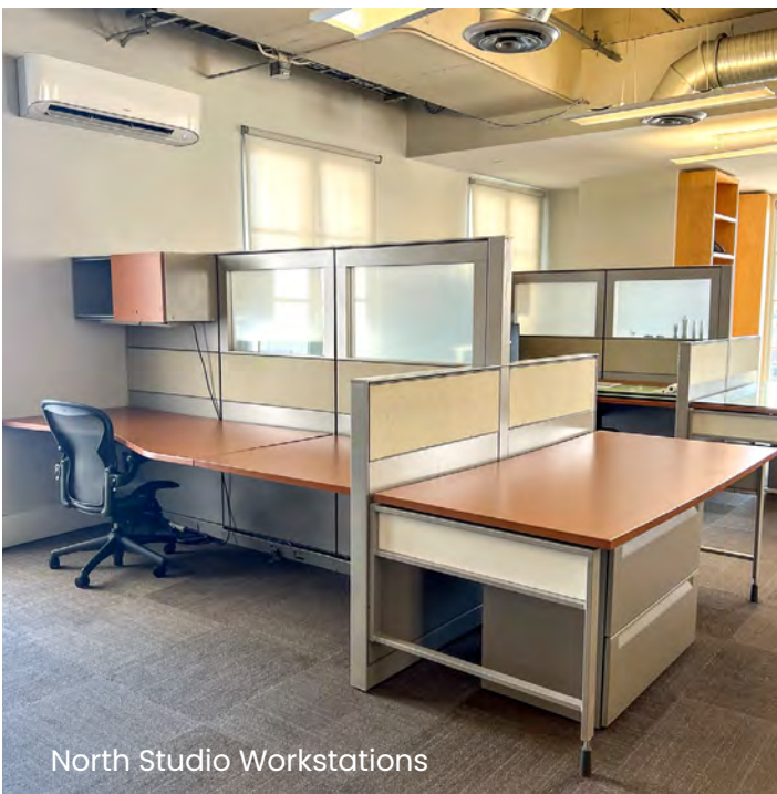
North Studio Workstations