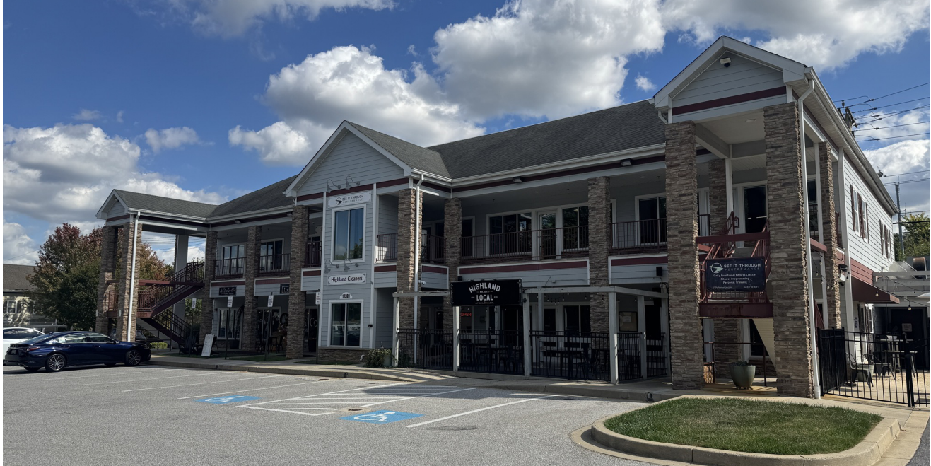
13380 | 2nd Gen Restaurant