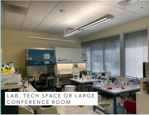
LAB, TECH SPACE OR LARGE CONFERENCE ROOM