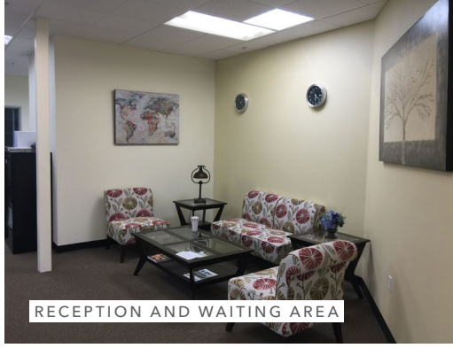
RECEPTION AND WAITING AREA