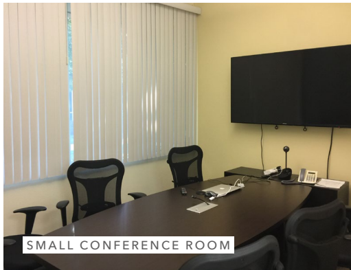
SMALL CONFERENCE ROOM