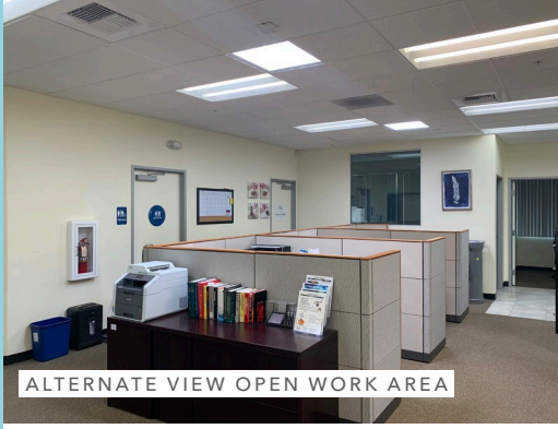
ALTERNATE VIEW OPEN WORK AREA