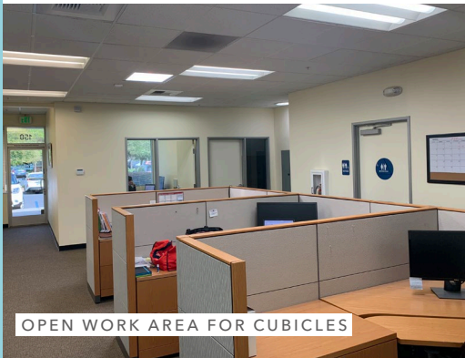
OPEN WORK AREA FOR CUBICLES