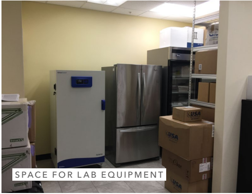
SPACE FOR LAB EQUIPMENT