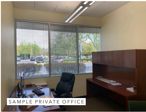
SAMPLE PRIVATE OFFICE