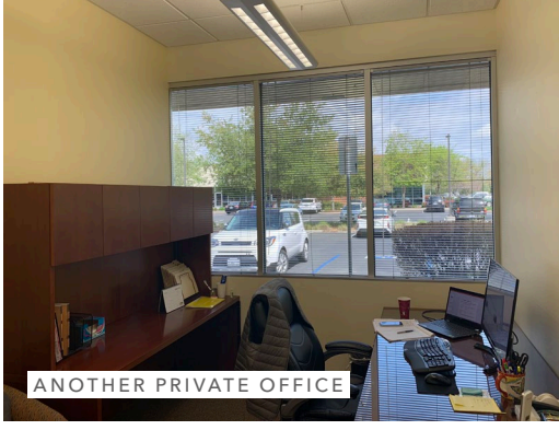
ANOTHER PRIVATE OFFICE