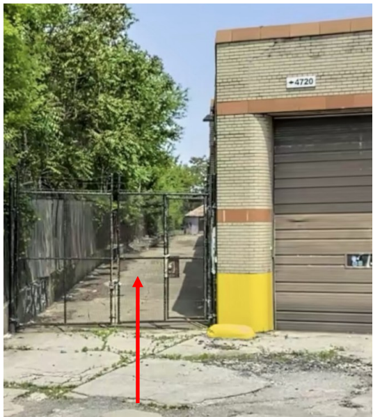
13.5' drive lane from Montrose to rear parking field.