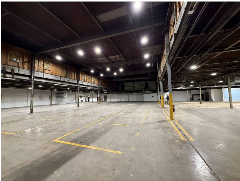
25' Section is 5,760 SF.

CONTACT Craig Wolf 773 736 3600 Office 847 989 9653 Mobile craig@straussrealty.com