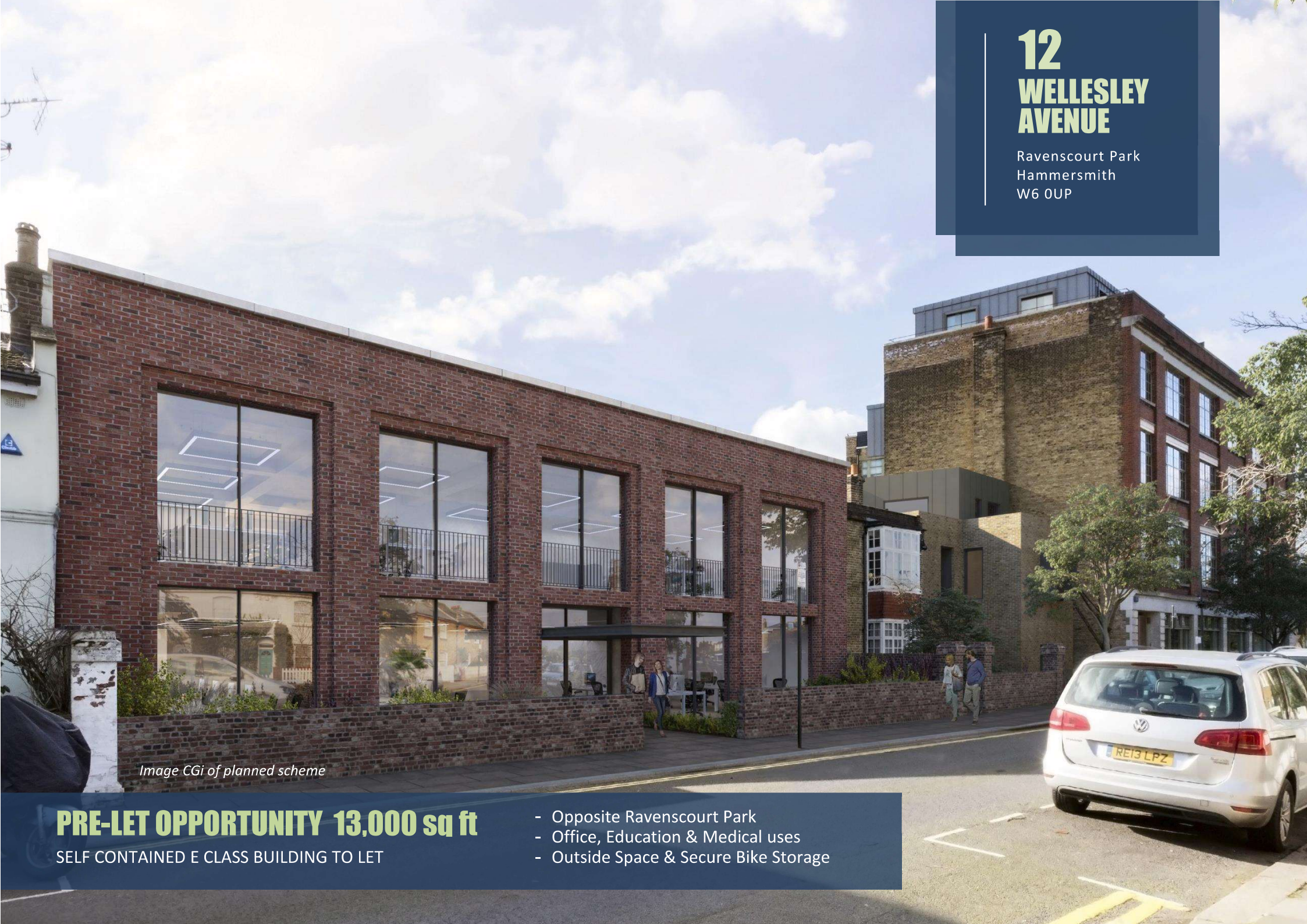
Image CGI of planned scheme