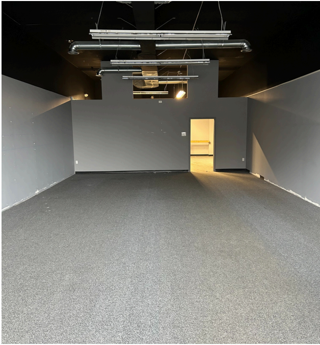
Interior former Retail Space: