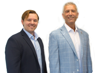
THE A.R.E.A. TEAM