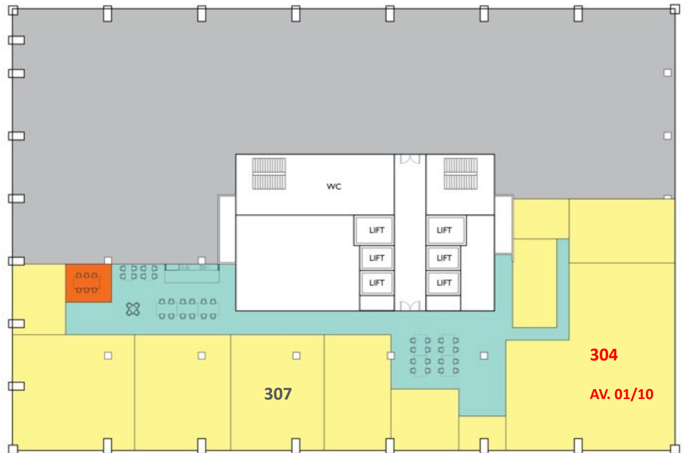
3 rd Floor

Just a 7-minute walk from Birmingham New Street, the Cubo Birmingham office space is the ideal setting for convenient, flexible working. Designed over two huge floors with panoramic views over Birmingham city centre, it is a definitely an impressive space for you and your clients. You can access the Cubo floors via lift or stairs, and members have building access 24/7.