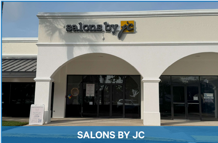
SALONS BY JC