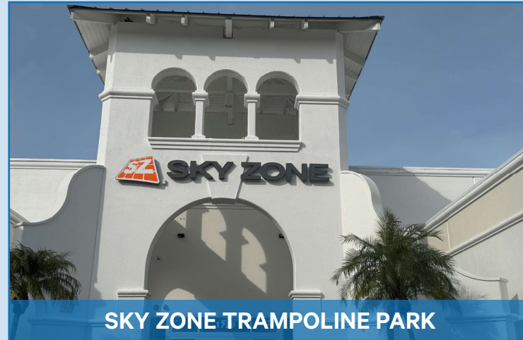
SKY ZONE TRAMPOLINE PARK