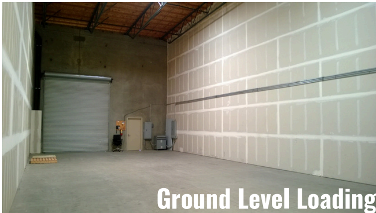
Ground Level Loading