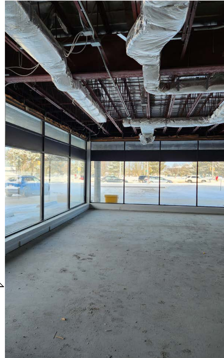
920 PRINCESS ST. - SUITE 120 & 130