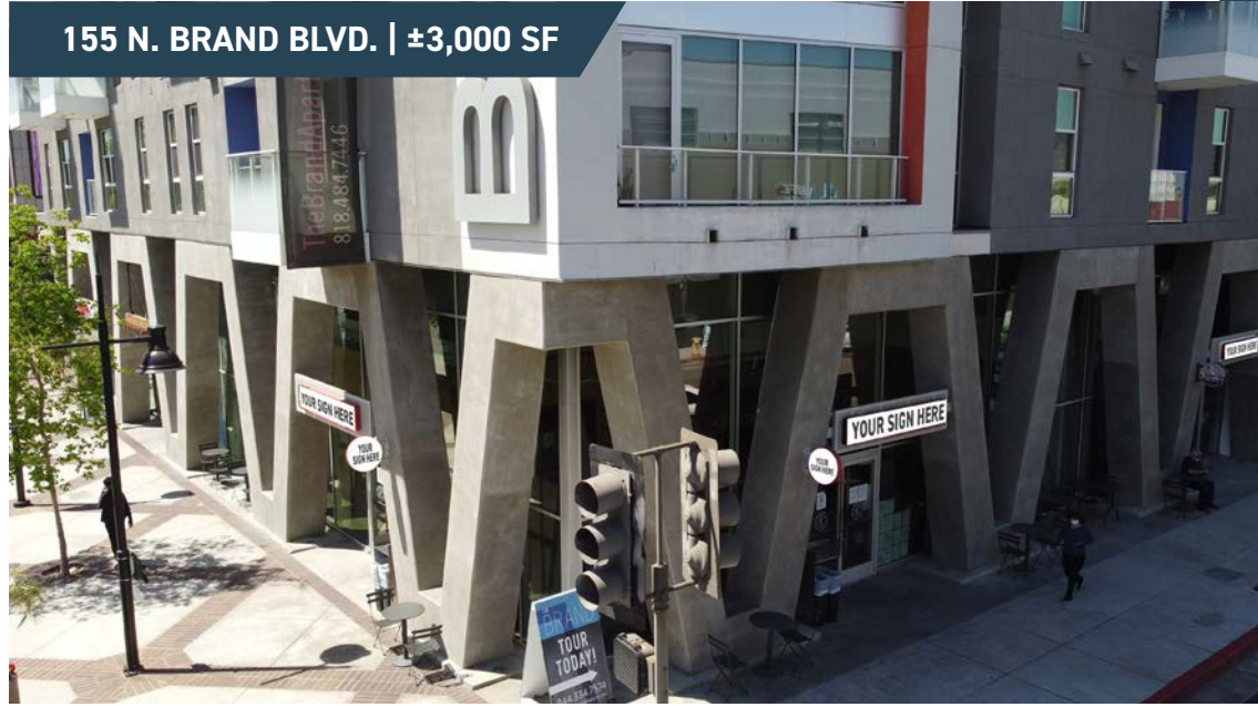
155 N. BRAND BLVD. | ±3,000 SF