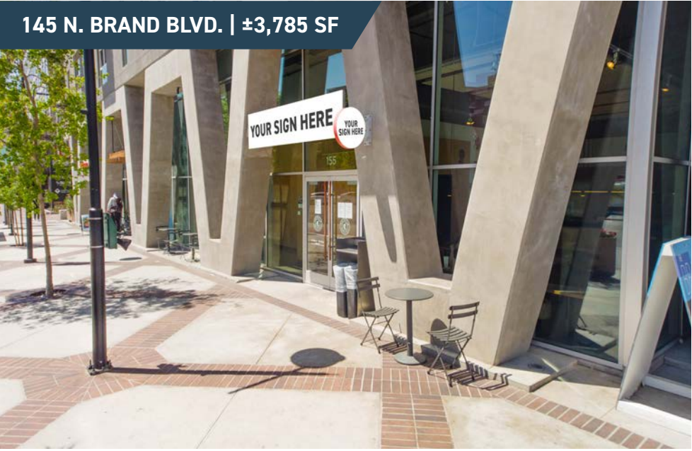
145 N. BRAND BLVD. | ±3,785 SF