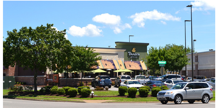
Busy Retail Center

Dollar Tree Panera Bread (w/drive-thru) Rainbow Outback Steakhouse Cinema Cafe Park Lane Pet Supplies "Plus" Planet Fitness Enson Market (coming soon) Hub Food Hall (coming soon) Other notable local retailers