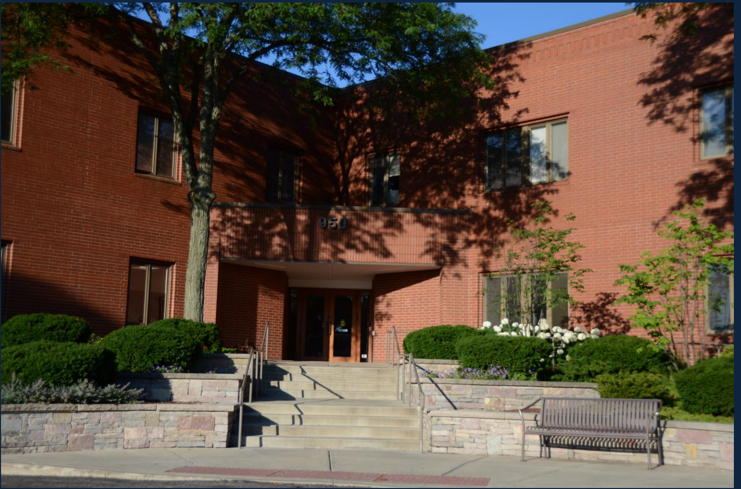
950 N. York – Main Entrance