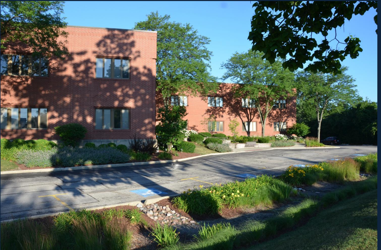
950 N. York Road