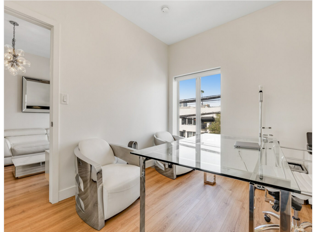
6212 Santa Monica Blvd_Unit A_Fourth Wall Production_3