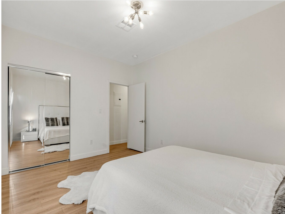
6212 Santa Monica Blvd_Unit A_Fourth Wall Production_15