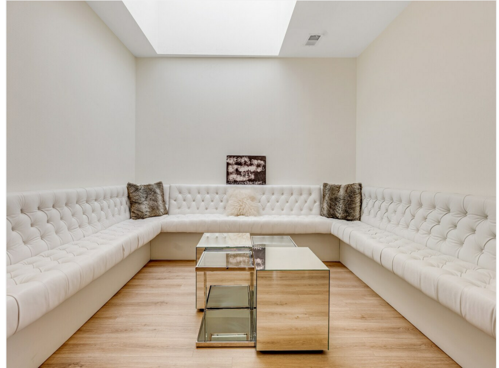
6212 Santa Monica Blvd_Unit A_Fourth Wall Production_7