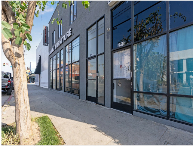
6212 Santa Monica Blvd_Unit A_Fourth Wall Production_19

6208-612 Santa Monica Blvd, Los Angeles, CA 90038