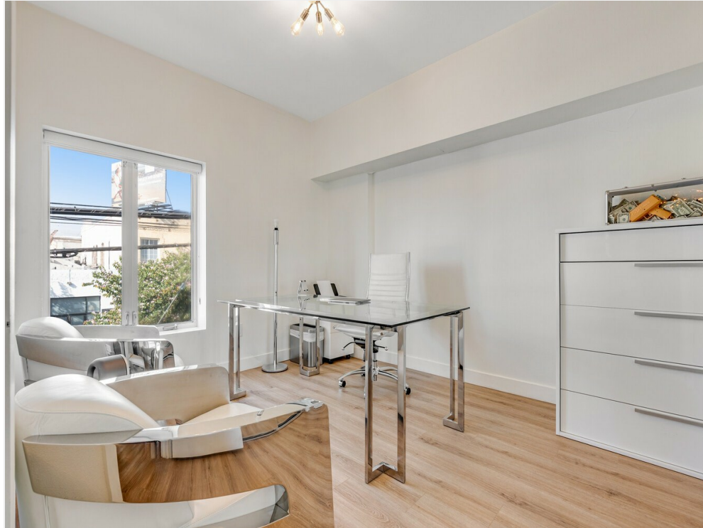
6212 Santa Monica Blvd_Unit A_Fourth Wall Production_2