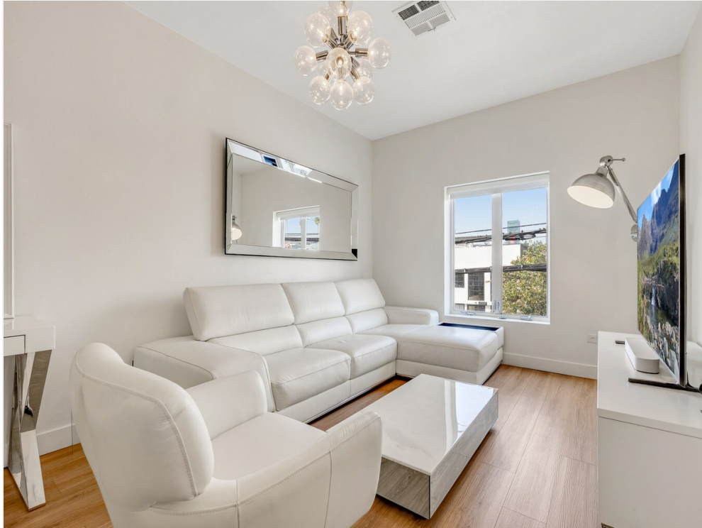
6212 Santa Monica Blvd_Unit A_Fourth Wall Production_4