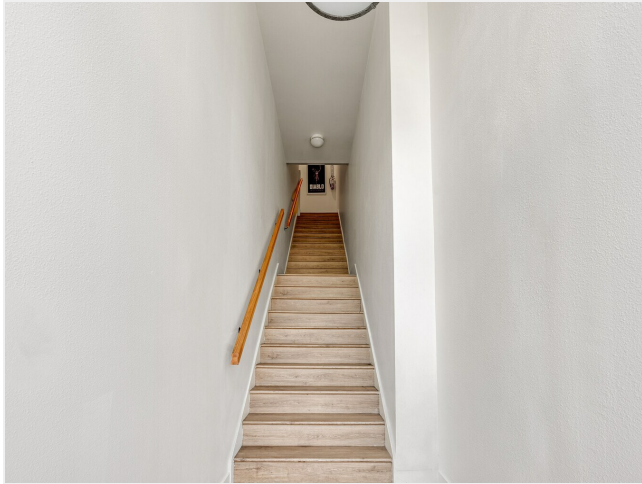
6212 Santa Monica Blvd_Unit A_Fourth Wall Production_18