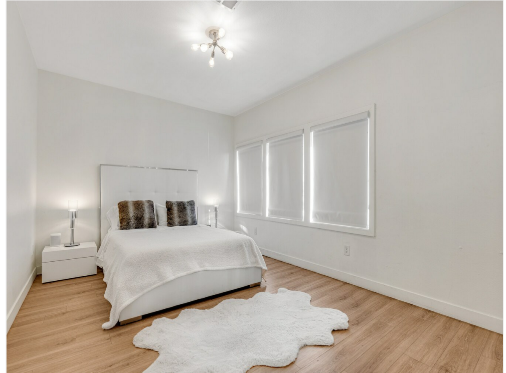
6212 Santa Monica Blvd_Unit A_Fourth Wall Production_14