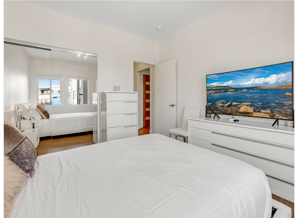
6212 Santa Monica Blvd_Unit A_Fourth Wall Production_12