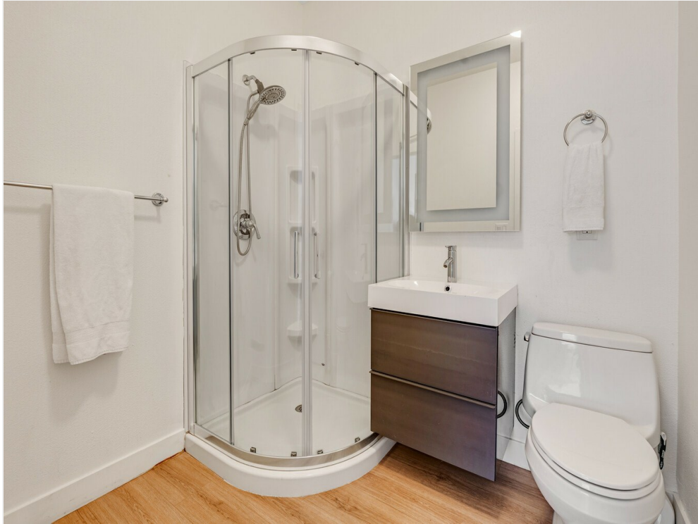
6212 Santa Monica Blvd_Unit A_Fourth Wall Production_9