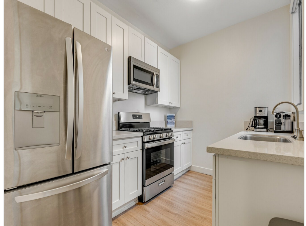
6212 Santa Monica Blvd_Unit A_Fourth Wall Production_16