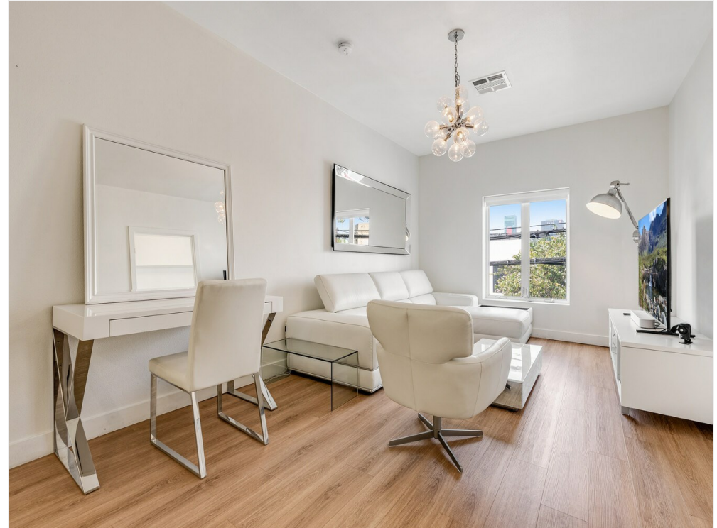
6212 Santa Monica Blvd_Unit A_Fourth Wall Production_5