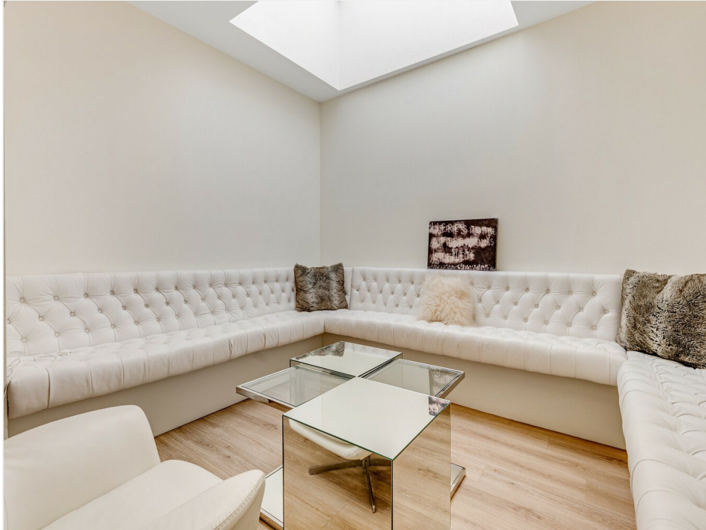
6212 Santa Monica Blvd_Unit A_Fourth Wall Production_6