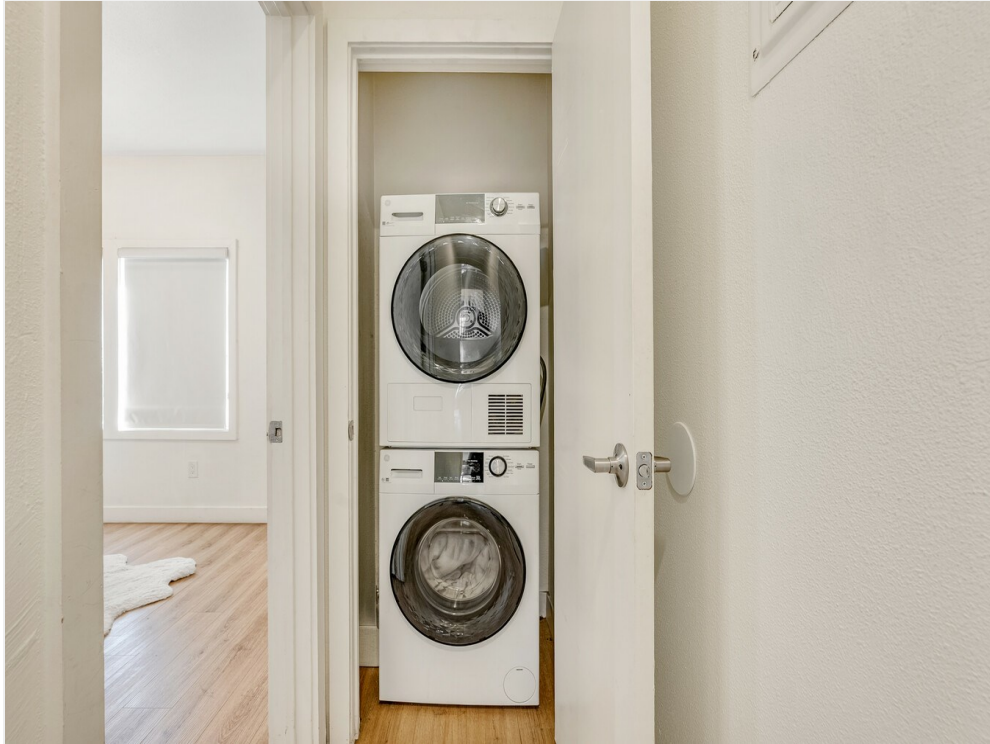
6212 Santa Monica Blvd_Unit A_Fourth Wall Production_13