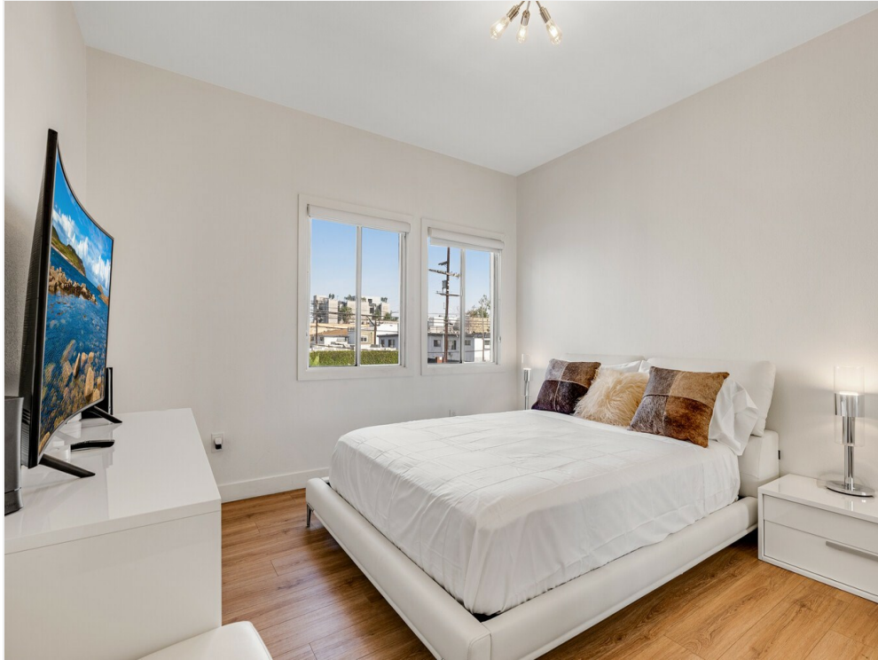
6212 Santa Monica Blvd_Unit A_Fourth Wall Production_11