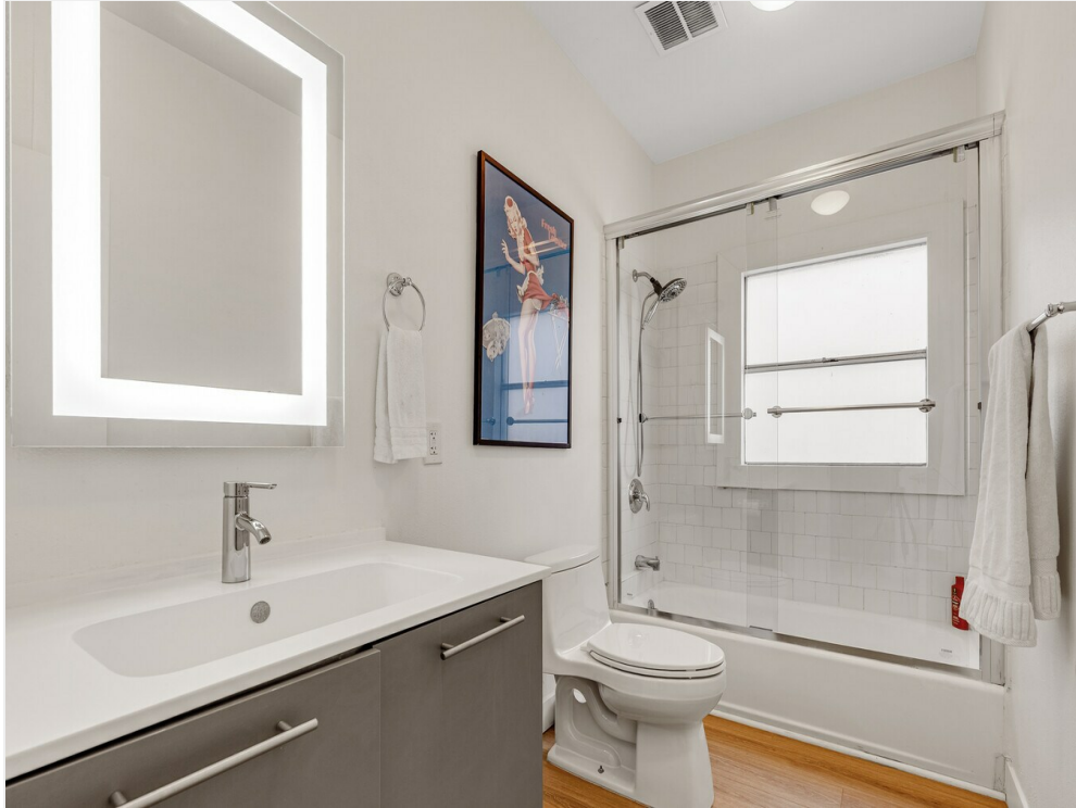
6212 Santa Monica Blvd_Unit A_Fourth Wall Production_17