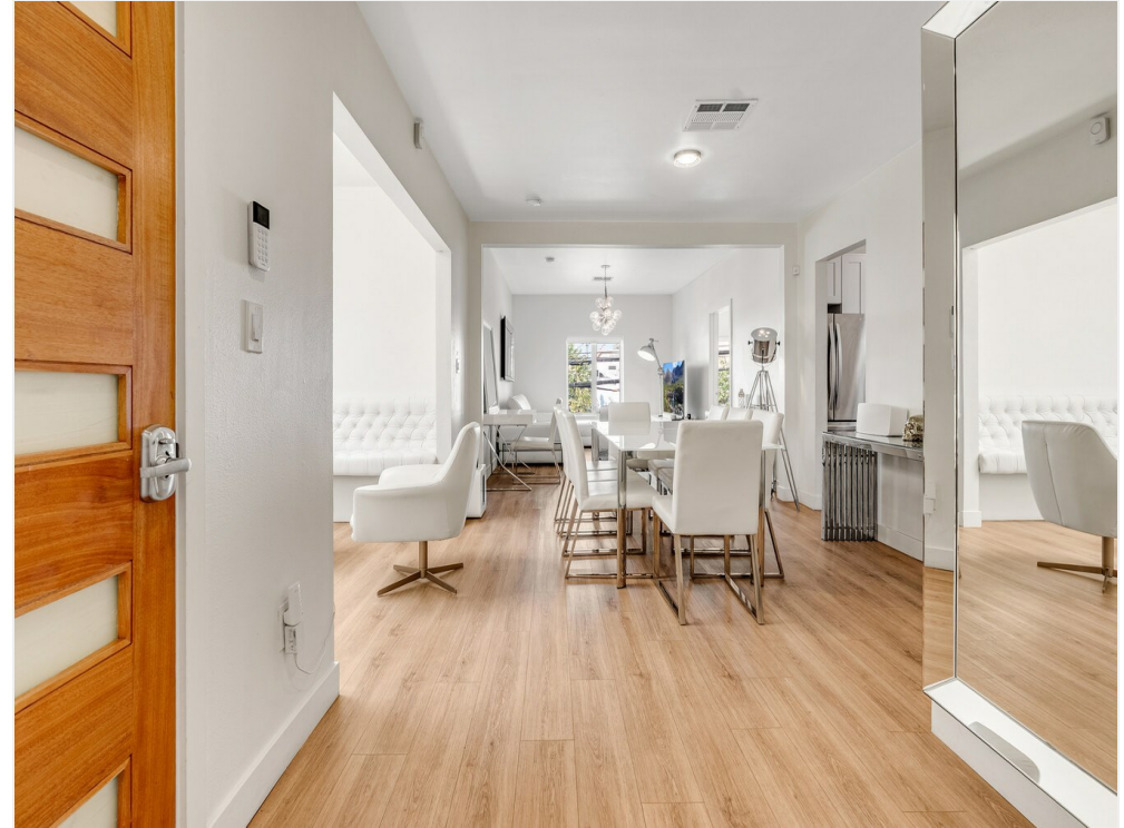
6212 Santa Monica Blvd_Unit A_Fourth Wall Production_10