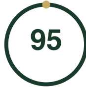
WALK SCORE Walker's paradise