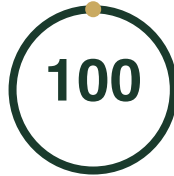
TRANSIT SCORE Rider's paradise