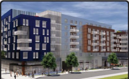
321 W Ocean Blvd 580 Apartment Units Above Retail - Under Construction