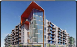
1 Golden Shore 750 Proposed Apartment Units to Replace Existing Office Tower