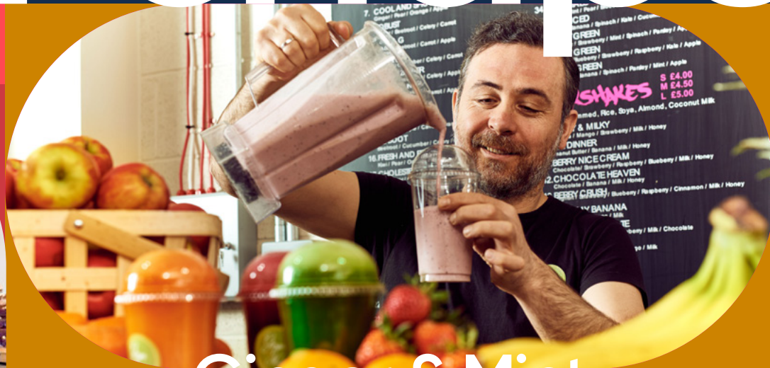
Ginger & Mint