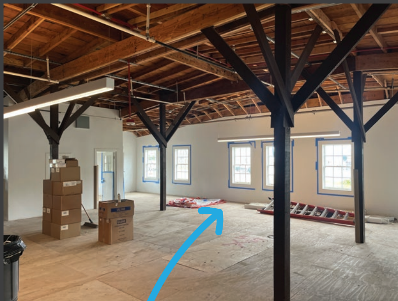
tons of natural light