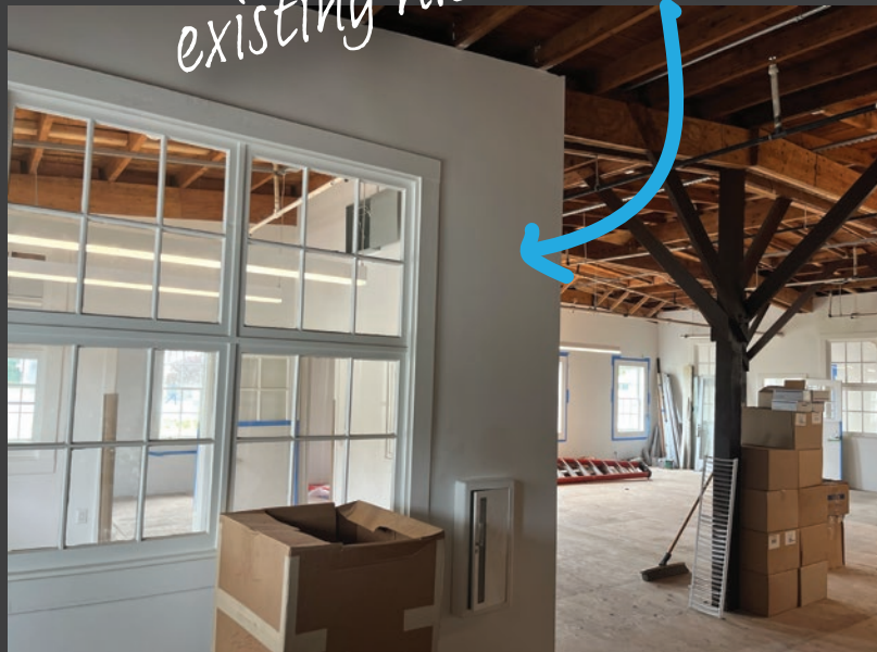
existing historical space