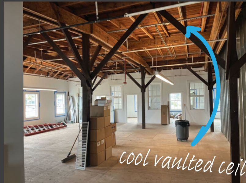
cool vaulted ceilings!