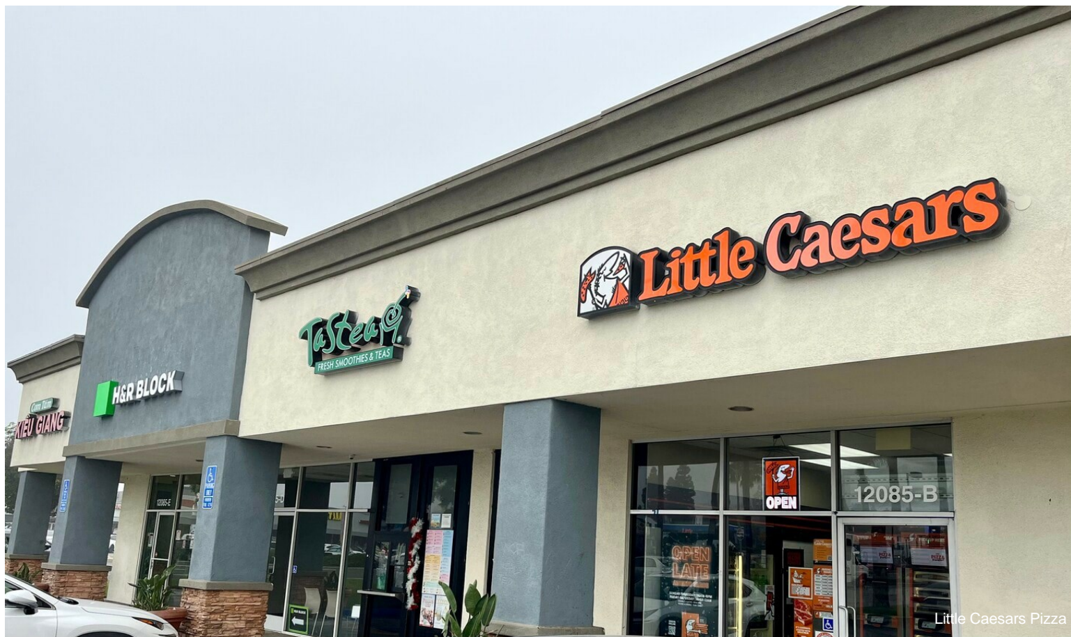
Little Caesars Pizza