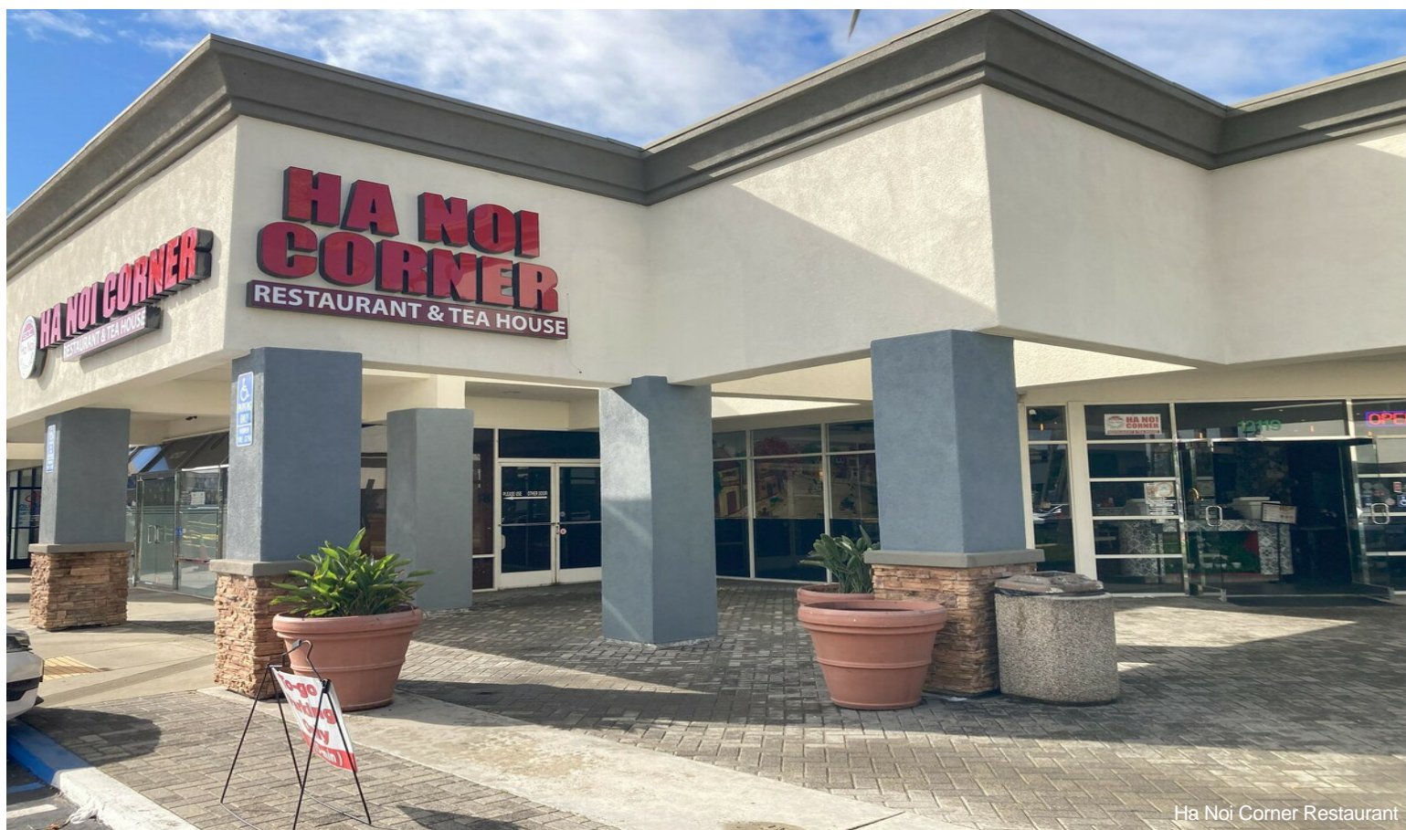
Ha Noi Corner Restaurant