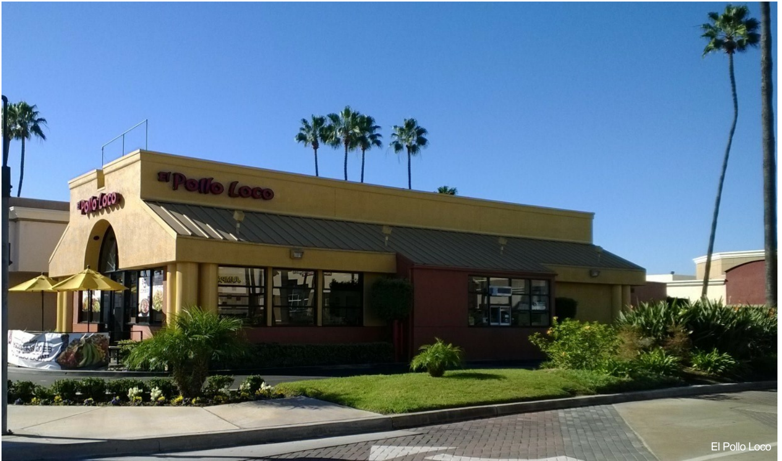
El Pollo Loco