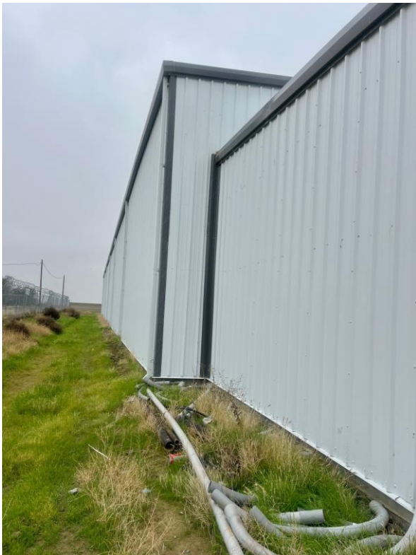
Flexible metal construction