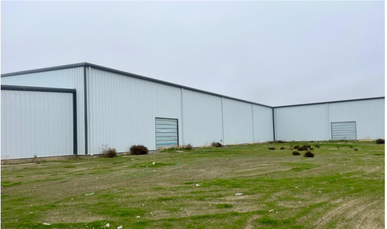
Ground level loading with easy access into warehouse from parking or storage lot area