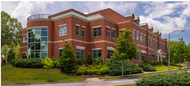
17251 Melford Boulevard

Melford Town Center includes three Class 'A' multi-story office buildings totaling more than 327,000 square feet of space. Tenant sizes from 1,252 square feet to 150,000 square feet of space offer businesses headquarters-worthy location.