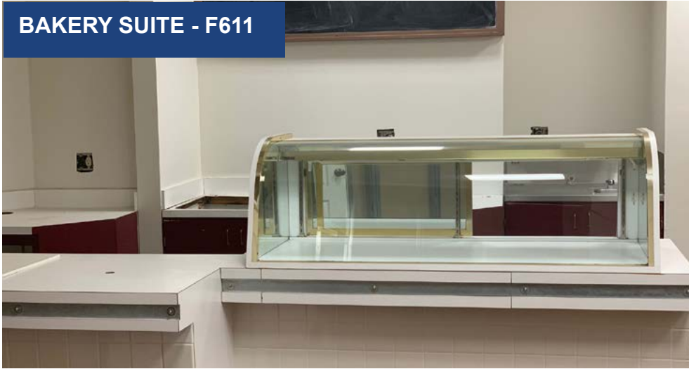
BAKERY SUITE - F611

YUBA SUTTER MARKETPLACE 1185 - 1265 COLUSA AVE YUBA CITY, CA