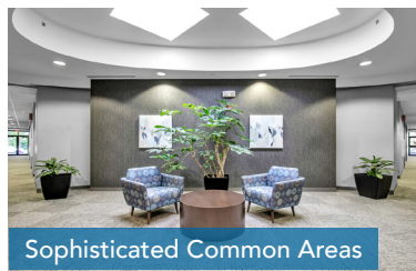
Sophisticated Common Areas