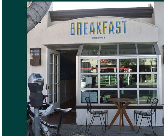
BREAKFAST BY SALT'S CURE