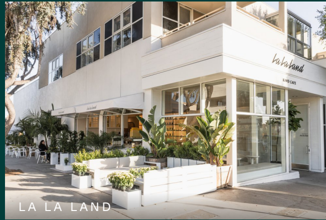
LA LA LAND