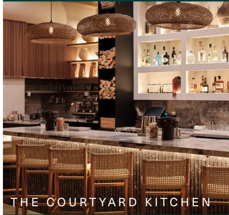
THE COURTYARD KITCHEN