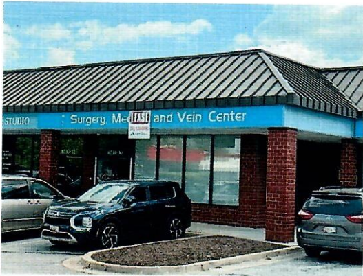
Glass storefront & Signage

COMMERCIAL & INVESTMENT REALTY ASSOCIATES, LLC