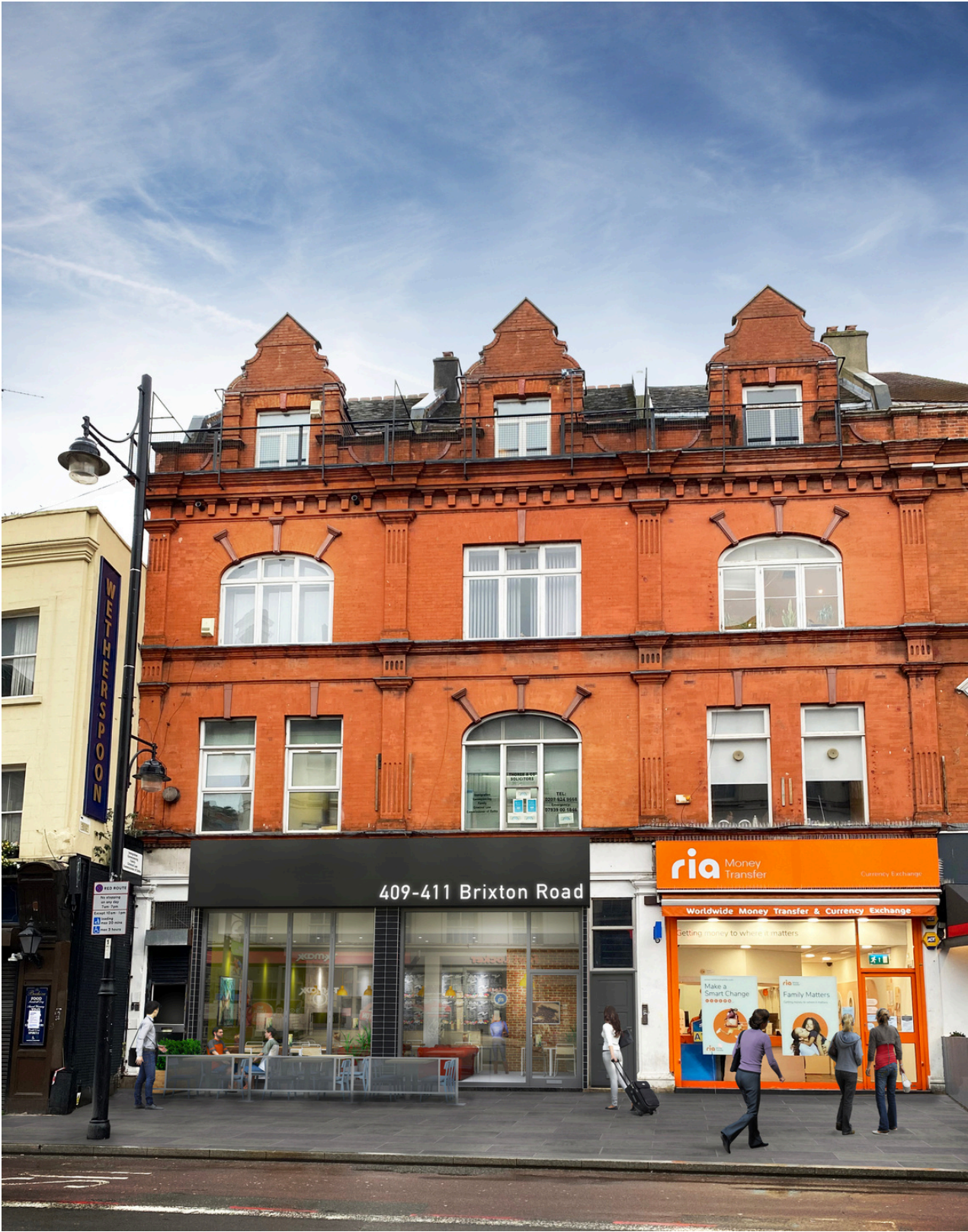
CGI Image of how unit could look with new frontage and outside seating.