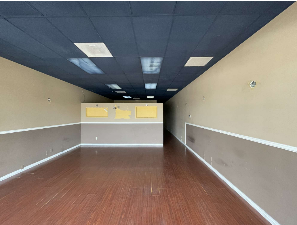
Former Foot Massage (990 SF) Space 17110-F (In-Line)