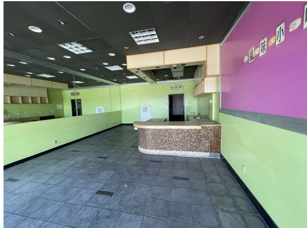
Former Restaurant (960 SF) Space 17110-G (In-Line)