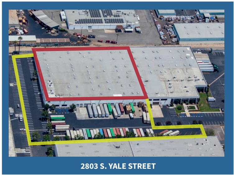
2803 S. YALE STREET