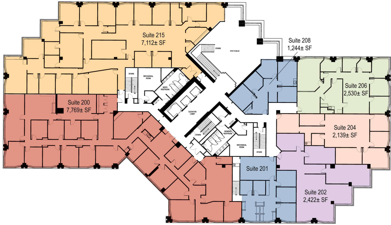
SECOND FLOOR PLAN ARCHITECTURAL