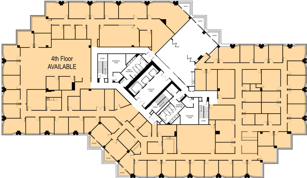
FOURTH FLOOR PLAN ARCHITECTURAL