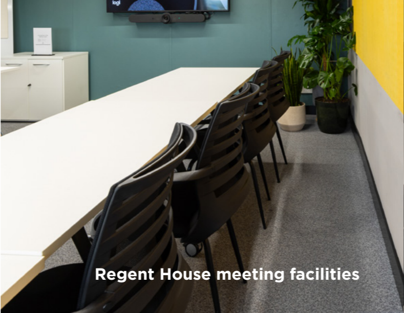
Regent House meeting facilities