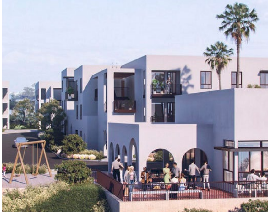
SAN YSIDRO SOUTHWEST VILLAGE SPECIFIC PLAN