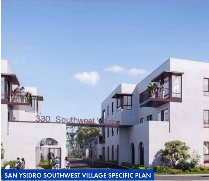
SAN YSIDRO SOUTHWEST VILLAGE SPECIFIC PLAN