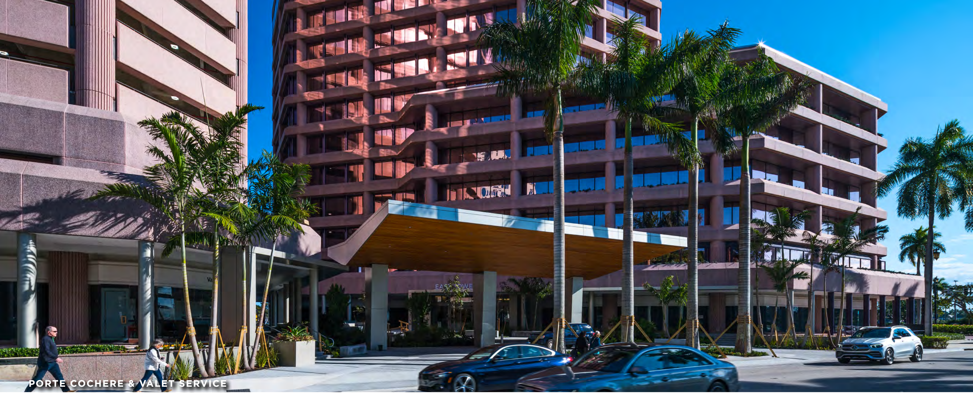
PORTE COCHERE & VALET SERVICE