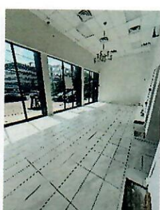
8735 First Ave. – Exterior view and interior view.