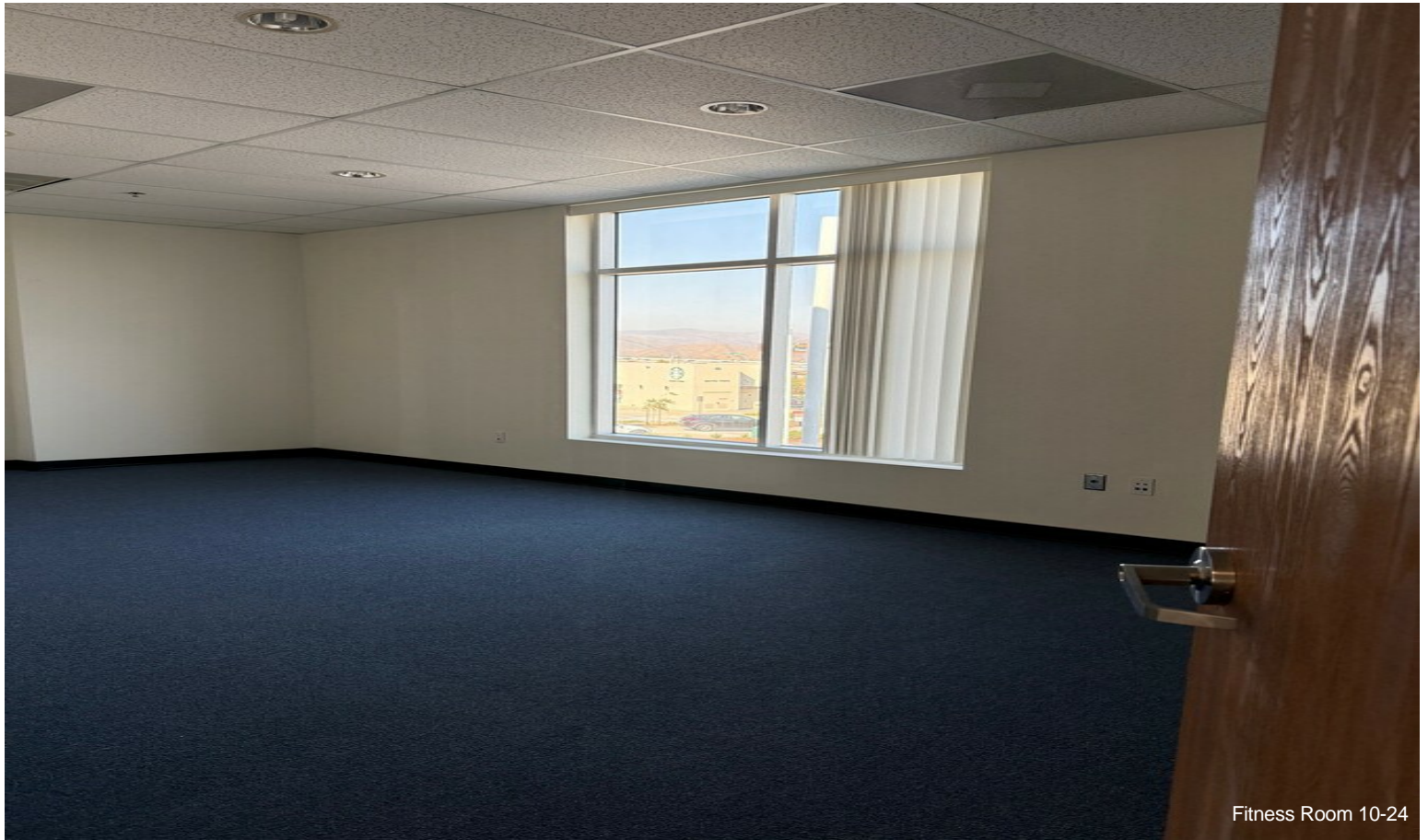
Fitness Room 10-24