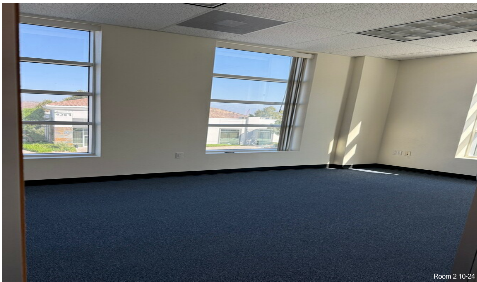
Room 2 10-24