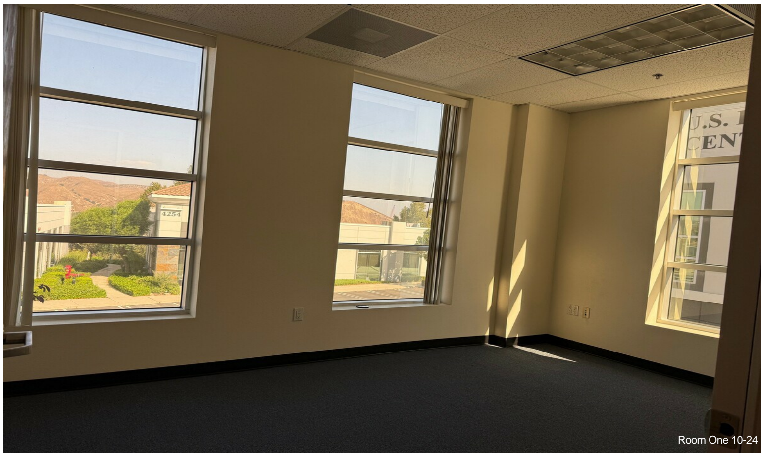
Room One 10-24