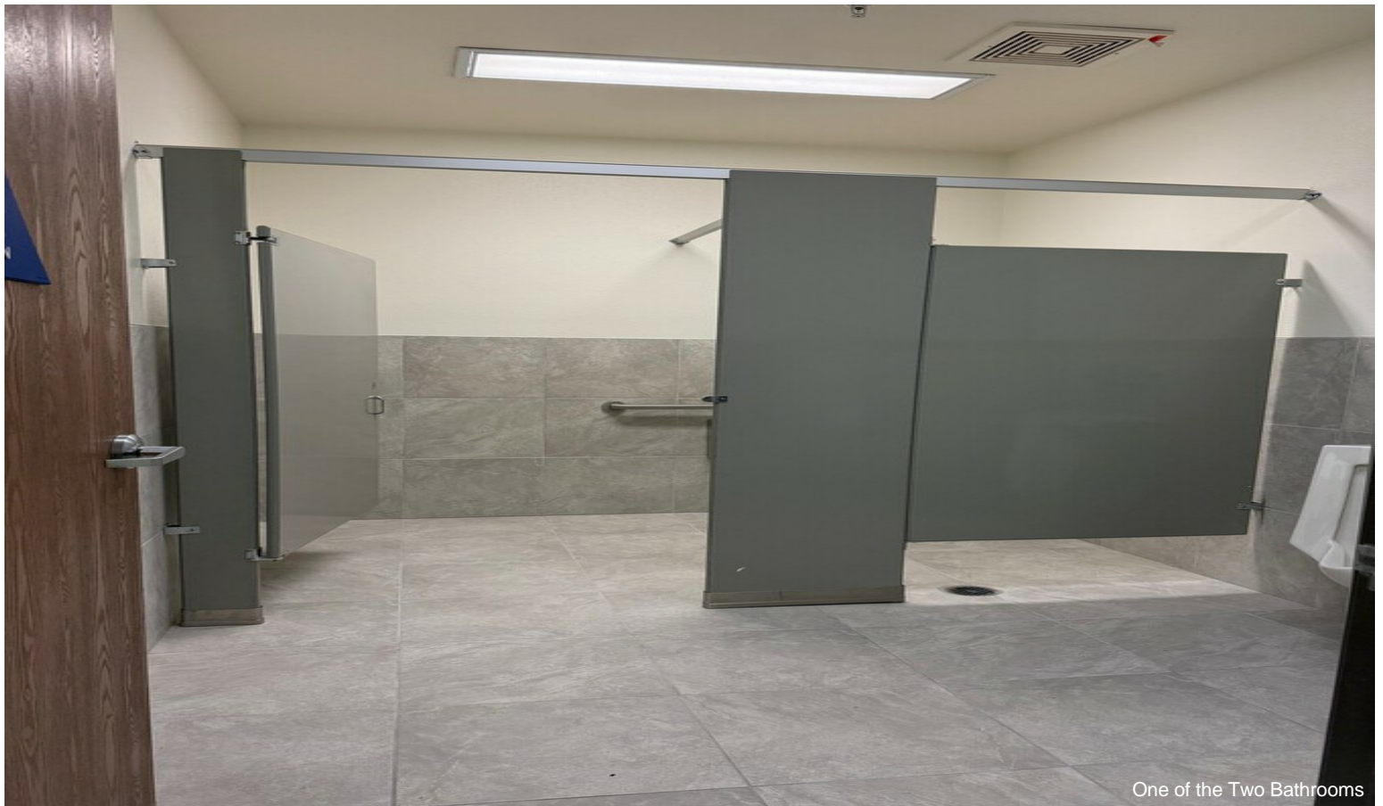
One of the Two Bathrooms