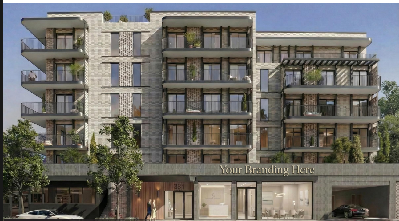
CONCEPTUAL RENDERING: SPACE B